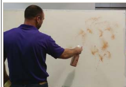
Apply randomly with spray bottle, shake continuously