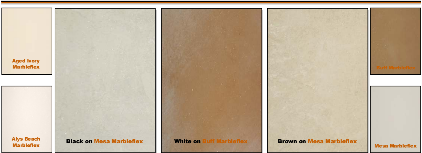
Vintique Color/Marbleflex Color, sprayed and sponge technique