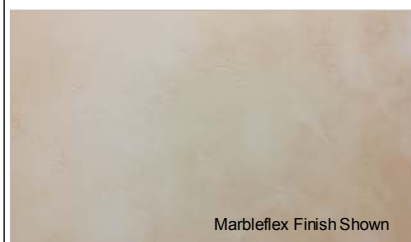
Marbleflex Finish Shown