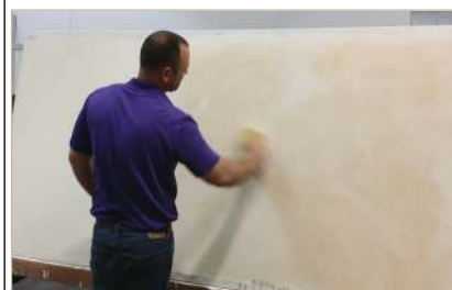
Blend wet Vintage with a sponge