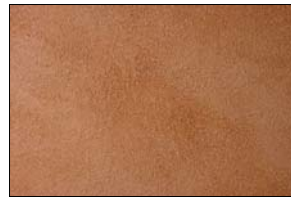
MW900 Adobe Vintage, 20% darker with #660 Refinish