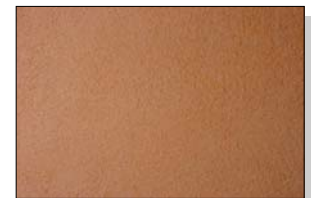
SW6625 Vintage with #933 Refinish