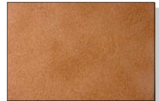
MW900 Adobe Vintage, 20% darker with #933 Refinish