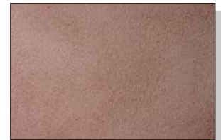
SW7023 Vintage with #933 Refinish