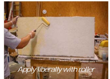
Apply liberally with roller