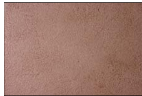
SW6038 Vintage with #660 Refinish