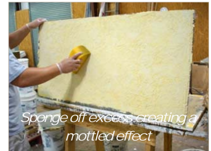
Sponge off excess creating a mottled effect