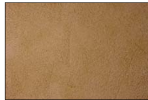
SW6156 Vintage with #933 Refinish