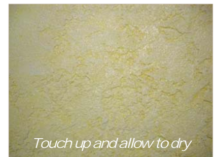
Touch up and allow to dry