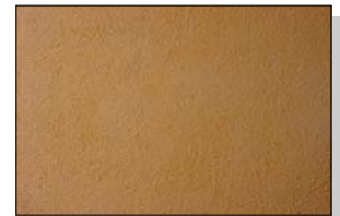
SW6359 Vintage with #933 Refinish