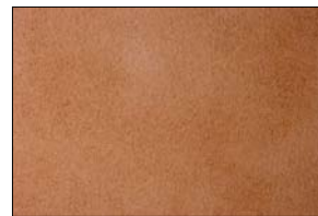
SW6059 Vintage with #933 Refinish