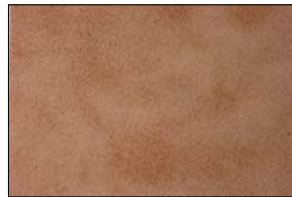
SW6094 Vintage with #933 Refinish