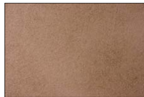
SW7045 Vintage with #660 Refinish