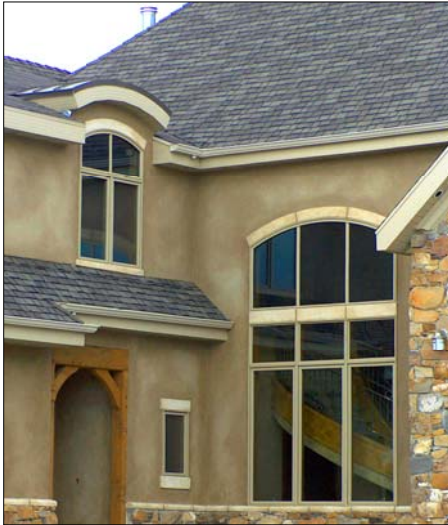
Brown on Beige Finish

Vintage is used as an antiquing stain to simulate century old plaster. Using a variety of artistic techniques, it's designed to create a faux finish while maintaining the durability of our Superior Finish.