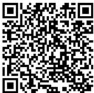
Stucco Cement Board Coatings

See full specifications and details at masterwall.com